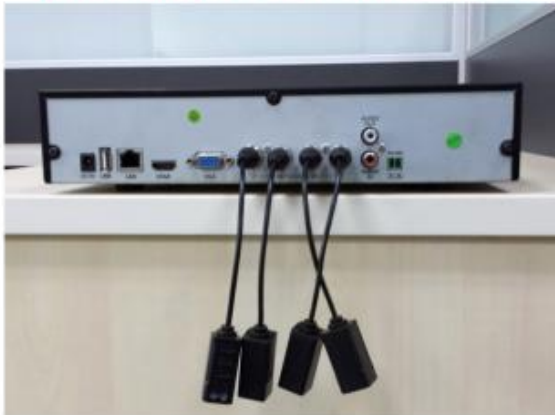
Old baluns make the cabinet a mess